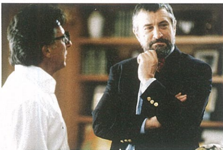
Figure 3.1 The storyline of the film Wag the Dog suggests that the media have the power to shape public opinion (see page 70).

The Canadian philosopher and writer Marshall McLuhan once said, 'The medium is the message.' He was referring to how an actual medium or device, such as a radio, television or computer, can determine the nature of the message that it carries. Think of mass communication as a spectrum: at one end is the